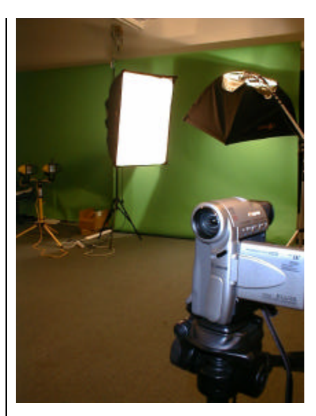
Figure 2: View of our "studio."

For this reason, we are now making available to the students a homegrown software system in C/C++ on Windows NT that uses the Intel Image Processing Library, Intel Computer Vision Library, and the Microsoft Vision SDK for more advanced video processing and analysis tasks. The students use this system to do development of their effects and then import the processed/synthesized video into Premiere for editing.