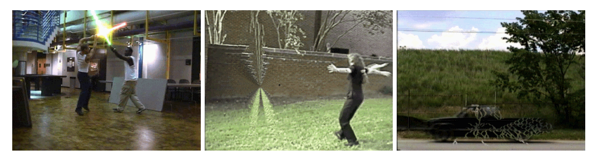
Figure 4: Three example projects from spring 1999 class. (left) Fighting with lightsabers, (center) a cloaked alien, and (right), a car vanishing into time.