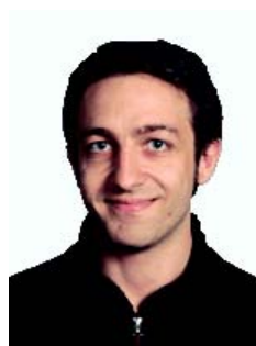
Karlsruhe, Germany, and University of Illinois, Chicago, USA.