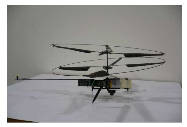
Figure 1: Proxflyer model retrofitted with new motors, SBC and miniature camera.

The choice of an appropriate flying machine is the focal point in the initial development of the system. We have already mentioned the positive reasons for the choice of the rotary wing concept, but we have to remember that helicopters are notoriously unstable, and that autonomy is difficult to achieve. For this reason we have given priority to stability, and have evaluated two recent and novel helicopter designs (Fig 1 and Fig 2) characterized by strikingly improved stability.