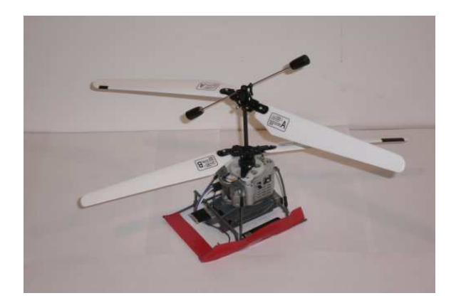
Figure 2: Hirobo XRB model

The first model evaluated was a Proxflyer (Figure 1). Commercialised as a toy, the Proxflyer has a weight of about 45g and is powered by three electric motors: two motors control the speed of the counterrotating rotors while a third controls te small upward pointed tail rotor. The rotors have a fixed pitch, so the only available controls are up/down (increasing or both decreasing the speed of rotors). forward/backward (activating the tail rotor to tilt the helicopter in the horizontal plane), and yaw (increasing or decreasing the speed of one of the rotors). Unlike a conventional helicopter, this model does not have any ability to control lateral movement. The augmented stability is achieved by exploiting the gyroscopic forces acting on the rotors, which are enhanced by a peripheral ring. This clever design results in an extremely stable flying machine that can hover hands-off if properly trimmed. However, the low forward speed and lack of lateral control are intrinsic drawbacks of the design.