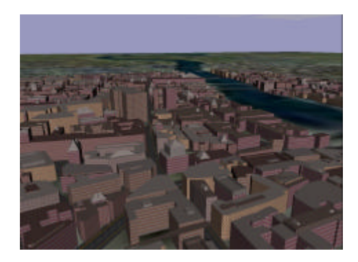
Figure 1: Typical snapshot of the model.

Each building is composed of two or three layers, entrance, middle and optional upper level and each has a roof. The entrance and upper level are tiled laterally, but are repeated only once vertically and have a fixed height. The centre layer is tiled and/or slightly stretched to fill the intervening gap. Textures are grouped together into matching sets and the set to apply to a particular building is chosen by a few simple heuristics: buildings with a small footprint are more likely to be brick, tall buildings are likely to be office blocks, and so on. The resulting model is stored as a VRML1.0 [4] model in 160 1km square tiles, with each tile being built upon a segment of the Cities Revealed aerial photograph for central London. Figure 1 shows an example view of the model and Figure 2 shows an overview of the model extent.