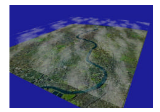
Figure 2: London from the south-west.