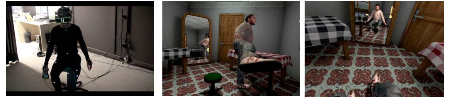
Figure 1 Left: a participant in motion capture suit, wearing a HMD; Middle:Avatar representation of the participant from third person view with mirror reflections and dynamic shadows; Right: First person view of avatar representation, with the avatar reflected in a mirror.

Mel Slater ICREA - EVENT Lab Universitat de Barcelona