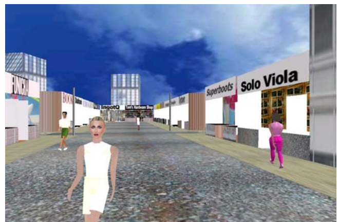
Figure 1: The Street.

A virtual world was created in 3D Studio MAX to resemble a typical street-like environment. One of the factors in the study was dependent on the number of different textures used in the scene. In the conditions with “ Repetitive Textures ”, 20 different textures were used to provide shop billboards and fronts whereas in the conditions involving “ Non-Repetitive Textures ” there was twice the number of textures (~40).