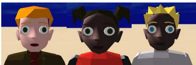
Figure 2: The cartoon form characters.

The street was populated with a total of 16 virtual characters walking up and down the main street however only 8 characters were on the street at any one time. The decision to activate only 8 characters in IVE at the same time was made due to a technical constraint in rendering all the characters in run-time at an acceptable frame rate.