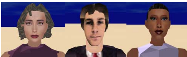
Figure 3: The higher fidelity characters.